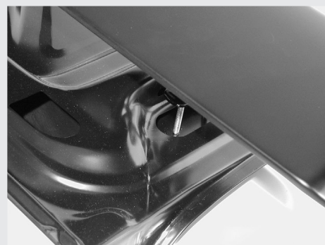
Aligning wing to underside of deck lid