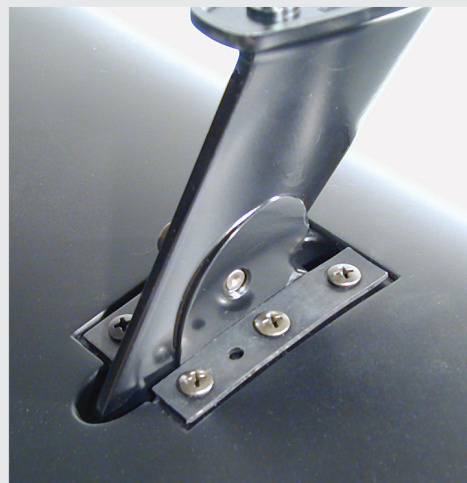
Outside mounting plate

C) The hard way is the way that is explained here. The problem with the above is that it leaves too much in the way of slop in mounting the wing. Most restorers want things to be more precise and perfect than what the above process allows.