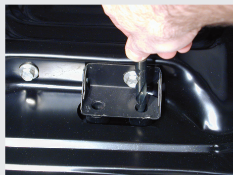
Marking Center with drill bit

m) Remount trunk lid using reinforcement brackets in their proper position, and align to body using reference marks created before removal.