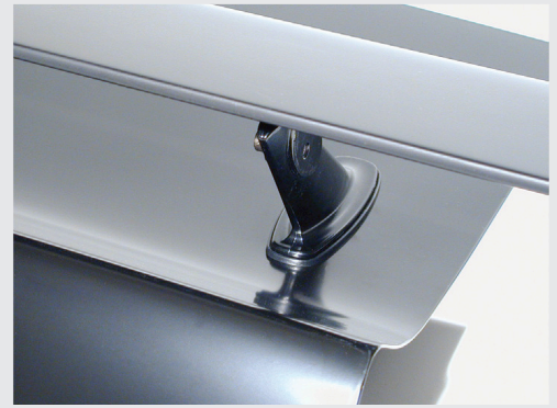
Bolted on and perfectly aligned

f) Adjust wing angle by loosening both Allen head bolts, adjust angle to desired position and re-tighten bolts.