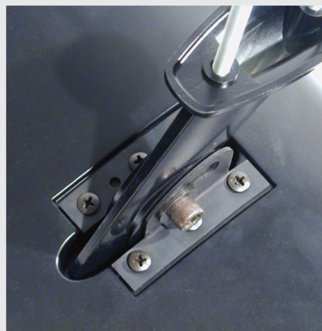
Inside mounting plate