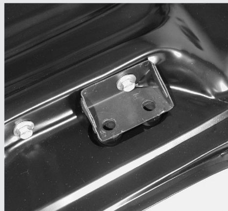
Reinforced plate C9ZZ-6344220-B Not included but sold separately if concours installation required.